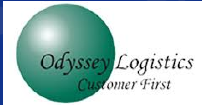
ODYSSEY LOGISTICS PVT LTD